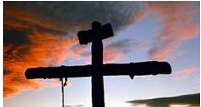
It is a Happy Easter because we serve a Risen Savior!